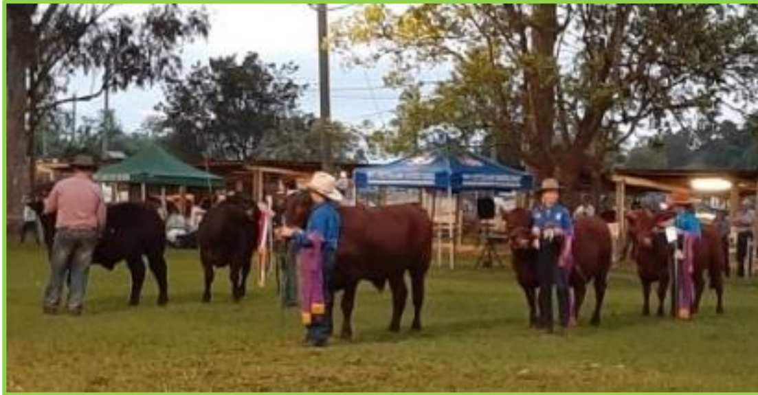
Pen of Three pure bred steer section

In the beef cattle section, the four heifers competed in the eight and under 12 months, and the 12 and under 16 months categories. Congratulations to Belarosa Red Poll Stud with Sonya (pictured right) taking away the Junior Champion and Grand Champion Red Poll.