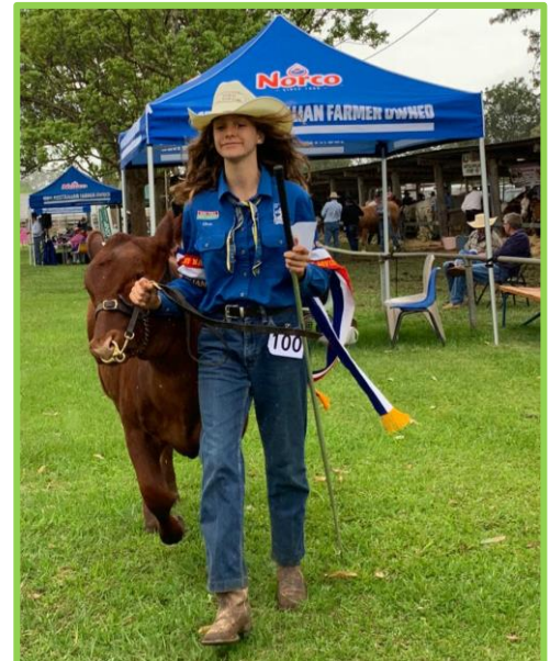
Bell-Hy and Belarosa Heifers Female 8 and under 12 months section

In the beef cattle section, the four heifers competed in the eight and under 12 months, and the 12 and under 16 months categories. Congratulations to Belarosa Red Poll Stud with Sonya (pictured right) taking away the Junior Champion and Grand Champion Red Poll.